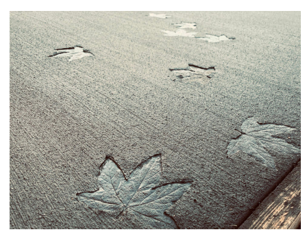
CUSTOM PRINTS AND EMBLEMS