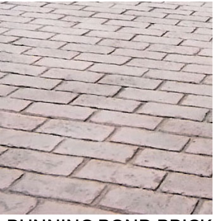
RUNNING BOND BRICK