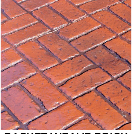
BASKET WEAVE BRICK