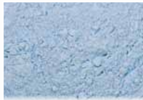
CR-670 – Powder Blue