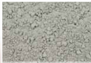
CR-592 – Slate Green