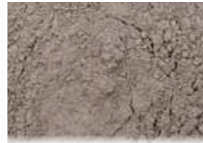
CR-389 – Dark Brown