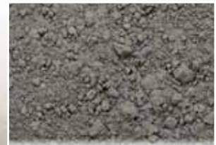
CR-927 – Gray