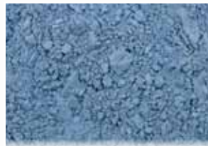
CR-675 – Star Blue