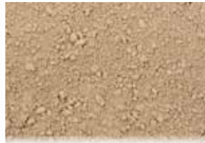
CR-219 – Sandy Buff