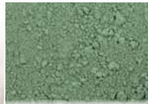
CR-520 – Spring Green