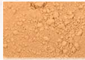
CR-730 – Misty Peach