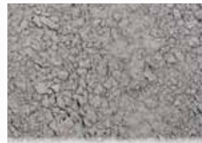
CR-923 – Silver