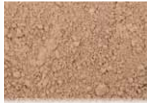
CR-300 – Autumn Brown