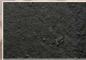
CR-960 – Rich Black