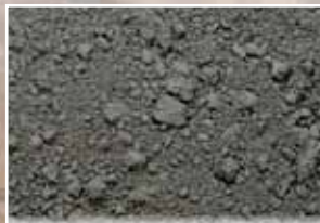
CR-935 – Charcoal