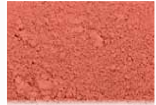
CR-827 – Sienna