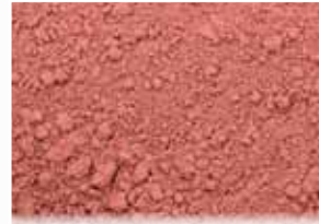
CR-835 – Red Brick