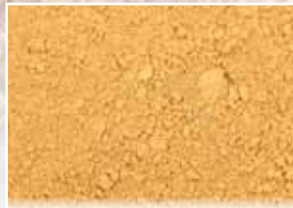
CR-700 – Light Goldenrod