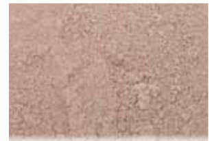
CR-228 – Copper Brown