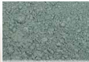
CR-599 – Seafoam Green