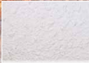
CR-NAT – Natural