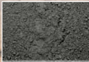
CR-947 – Dark Gray