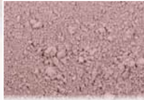
CR-880 – Lavender Blush