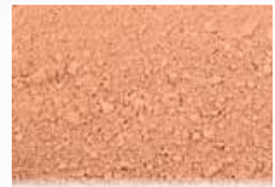
CR-718 – Terra Cotta